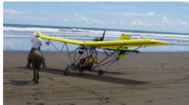
"Air Del Pacifico" care for a little aerial photography

Can you believe that we're coming up on our 5 th anniversary since re-hoisting our own flag as Strudwick Wealth Strategies ?! Our mission starting out was to create some innovative new services, and we've certainly far exceeded our goals in