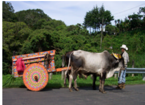
On the road to Starbucks!

Our last newsletter's prediction of a Kerry victory evidently struck a nerve. While we don't see a major impact in the U.S. markets either way, we do see disturbing signs of deterioration in the U.S. financial markets. But, ever the optimists, we also see a Bull market internationally. From what we're hearing, half the country will be taking the Berlitz course to join us in Costa Rica if JFK II wins, and the other half will be packing their bags if George pulls it out. Either way, we'll win. And here we were thinking we had until Hillary's run in '08 to pack our bags and go “ex-pat”. Regardless, it should be close. Even though the GOP ran an almost perfect convention in New York (You gotta love the theatre of Arnold's “economic girlie-men”), after watching George stumble through the debates it's obvious, a master communicator he's not. We kept finding ourselves saying “I know what he means, if he'd only say it this way instead...”